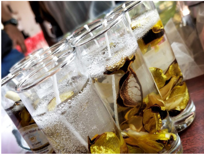
A few aesthetically beautiful candles on display