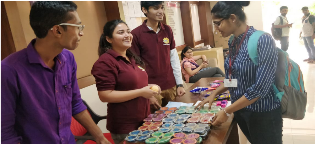
Members of SoRT council alongside volunteers of Samarthanam