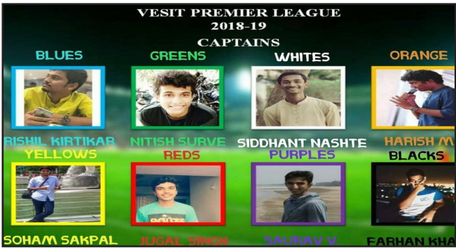
Captains of VPL 2018-19

Following are the teams and their players: