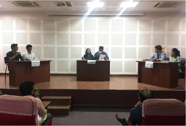
The audience looks on as D3 clash with D12C.

With the completion of this event, it was time to draw the curtains to the week-long activities of VESLit Circle for this academic year.