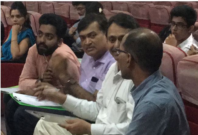
The judges review and discuss their scores.