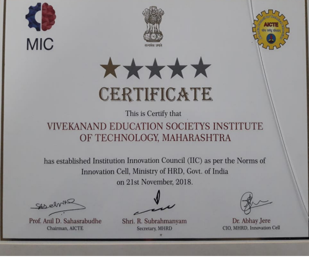
The certificate received by our college