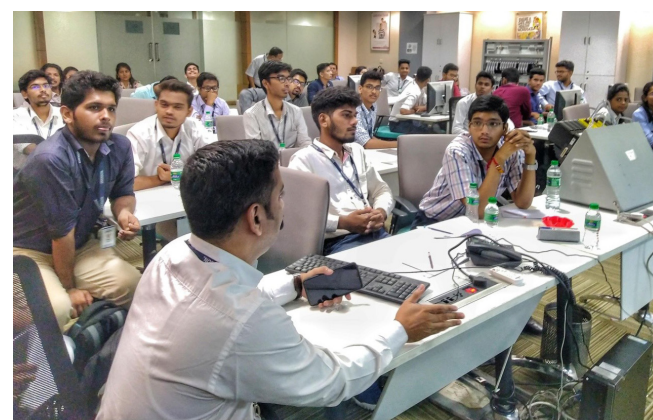
The students engaged in an interactive session