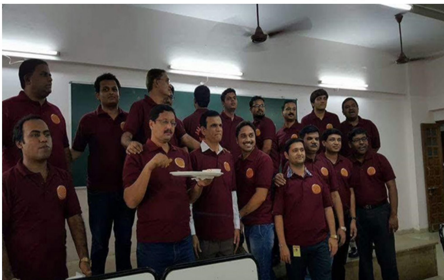
The jalebi group of VESIT

Looking up to this great group of friends, who enjoy the perfect camaraderie with each other, we can only hope for such #friendshipgoals in our lives too!